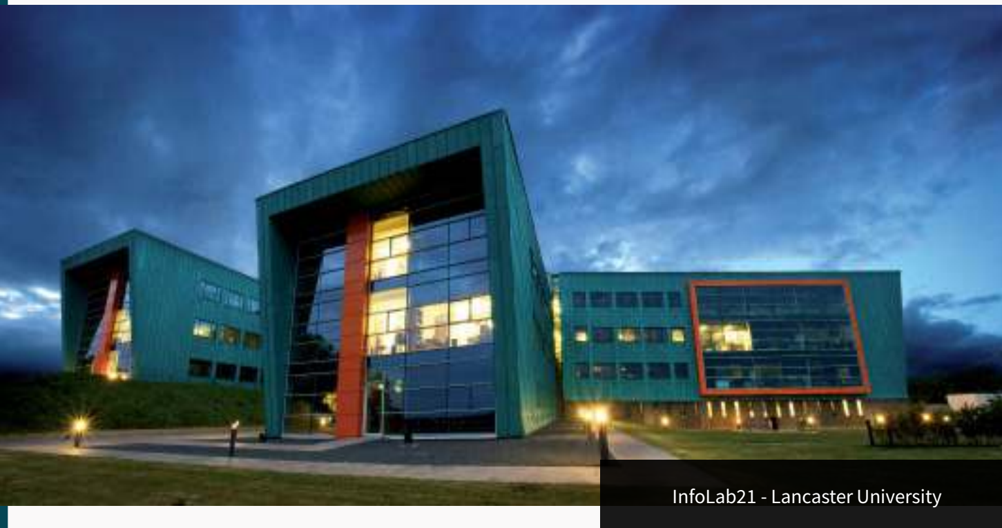
InfoLab21 - Lancaster University

We communicate with clarity. Mitigate recognise that for many organisations cyber security is uncharted territory. We offer reassurance by guiding them through the process and delivering supporting services.